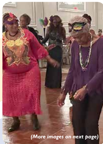
(More images on next page)

Another highlight was the drawing for gifts including smart TVs, coffee-makers, personal blenders, gift certificates and various gift baskets. Prizes awarded in the trivia question event included gift certificates and bags, and chocolates.