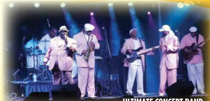
ULTIMATE CONCEPT BAND

JOIN US AGAIN FOR FAMILY FUN • AFFORDABLE FOOD FREE ADMISSION FREE ENTERTAINMENT