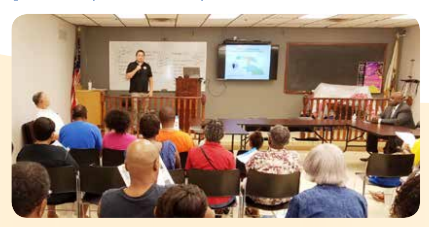
The July 18 meeting highlighted the detention Pond project at 25the Avenue and Washington Boulevard as presented by the Metropolitan Water Reclamation District of Greater Chicago.

Bellwood residents gained quality information and updates during the June and July Neighborhood Watch Meetings as the June 22 meeting featured a workshop on property fraud prevention by the Cook County Recorder of Deeds' office.